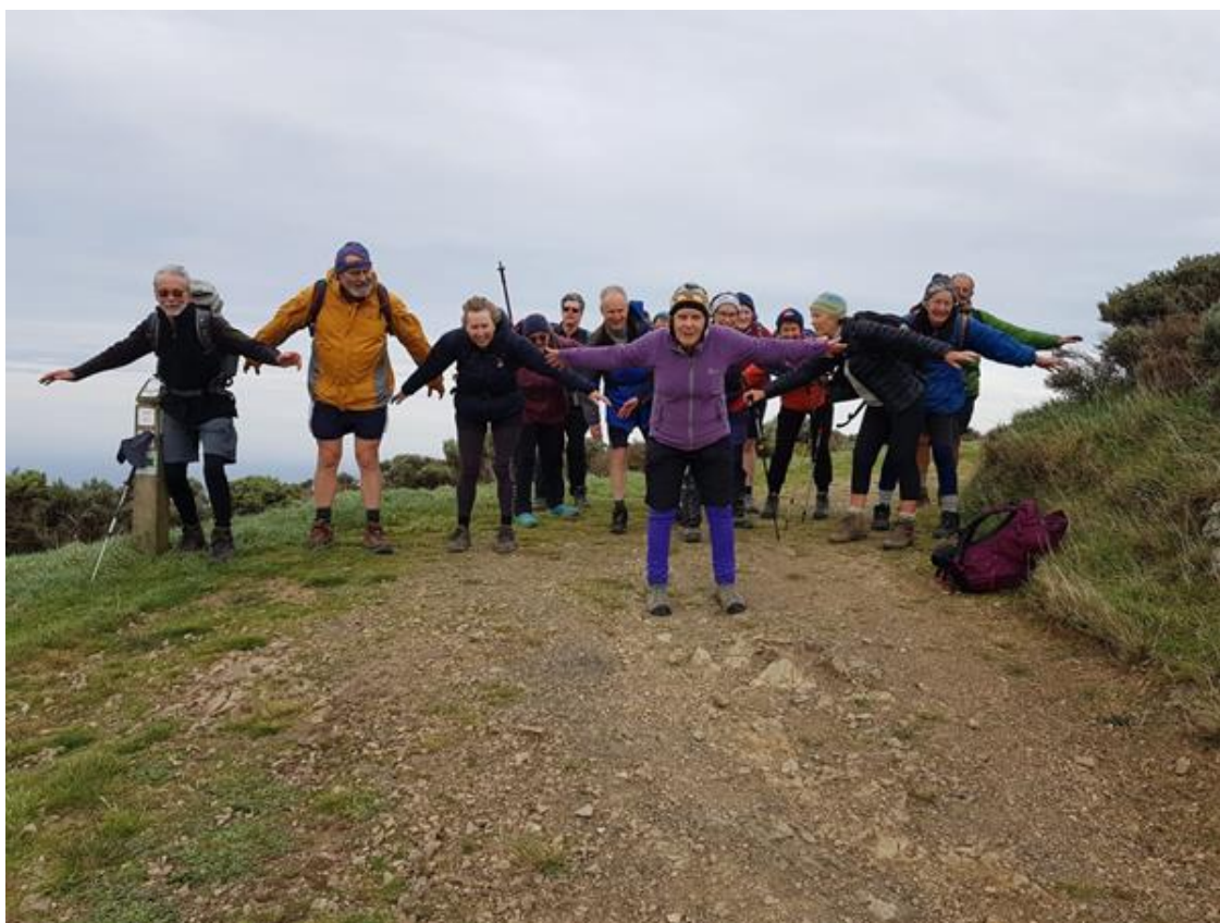
Tramping against the wind, Hawkins Hill 16 July.