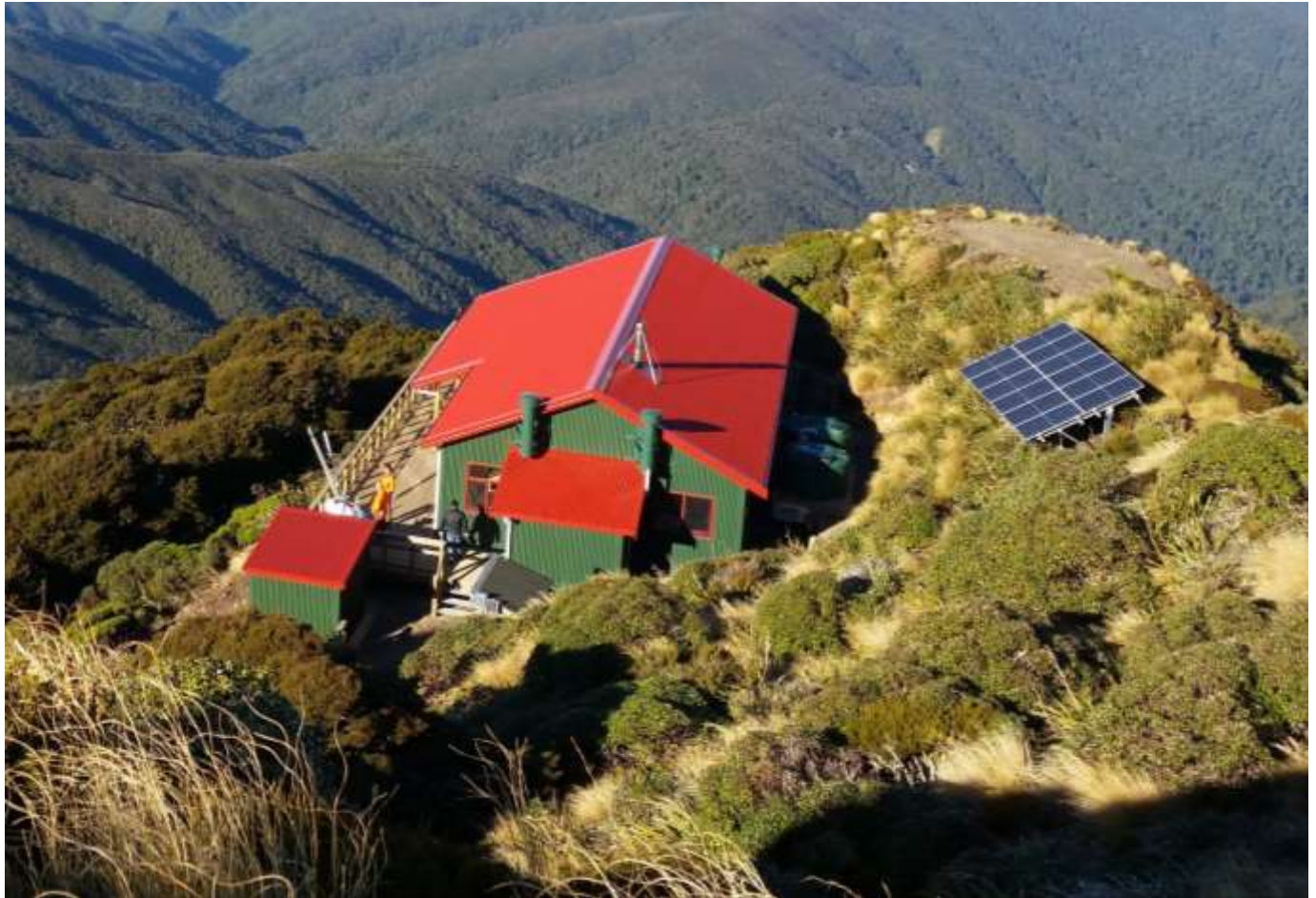
New Powell Hut

Please submit your September 2019 H&V articles to the editor by 28 th August 2019