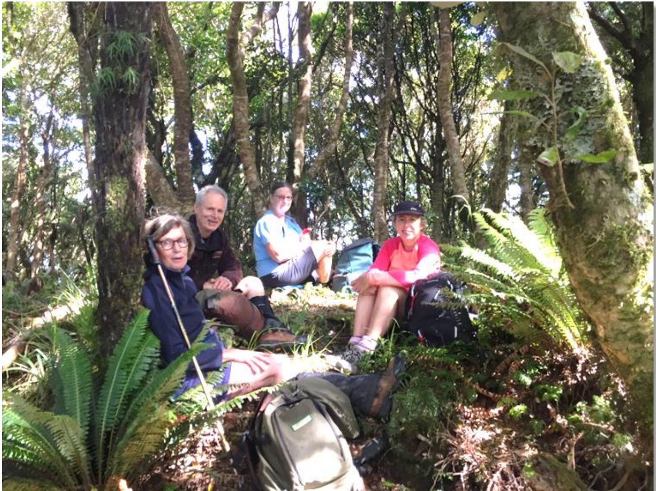
Morning tea in a ray of sun on Climie Ridge

OFFICIAL PUBLICATION OF THE HUTT VALLEY TRAMPING CLUB (Inc)